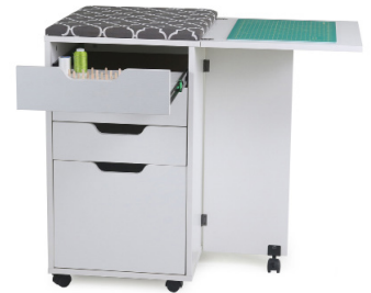
Kiwi Storage Cabinet

Every dream sewing oasis needs its cute, dependable accessories! Add even more convenience with a storage cabinet like Kiwi , featuring a built-in ironing board, cutting mat, thread drawers and a dedicated drawer to store your iron! Your dream sewing space won't be the same without it!