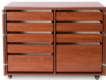
Dingo II Cutting Table

Kangaroo sewing cabinet - check! Now complete your studio with Kangaroo storage and cutting furniture, specially designed to complement your primary workstation. With extra storage and workspace, you can customize your sewing room to be stylish, comfortable, and even more productive!