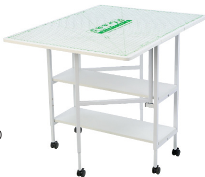
Dixie Cutting Table

Arrow sewing cabinet - check! Now add even more convenience to your studio with a dedicated cutting table like Dixie , specially designed to complement your primary Arrow sewing cabinet. Add style, storage and comfort to your growing sewing oasis!